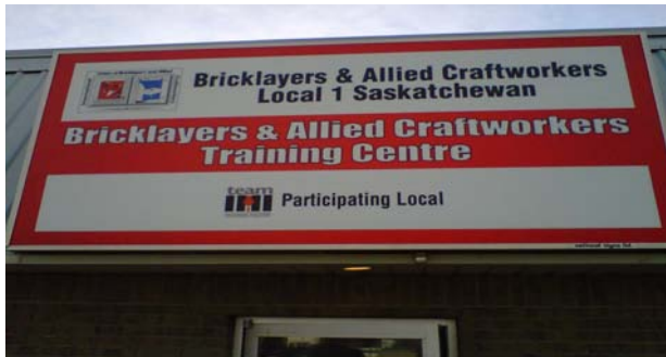
BAC Saskatchewan Masonry Craft Training Center

We are looking for new contractors to work with us in the masonry industry. Brick, Stone, Tile & Plastering Contractors can all benefit from our members working for them, and our benefit plans to take care of their pension and welfare needs. Why administer employee benefits when someone else can do it for you?