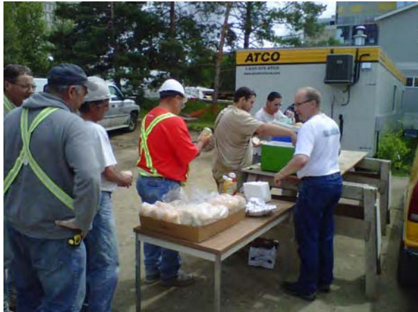
Craftworkers in Saskatoon enjoy a Burger courtesy BAC Local 1 Saskatchewan

Workers in the Masonry Industry can join the BAC in Saskatchewan for $16.50 per month for Journeypersons & $12.00 for Apprentices & Helpers. If you work anywhere in masonry, call one of our representatives or talk to a current member on the job.